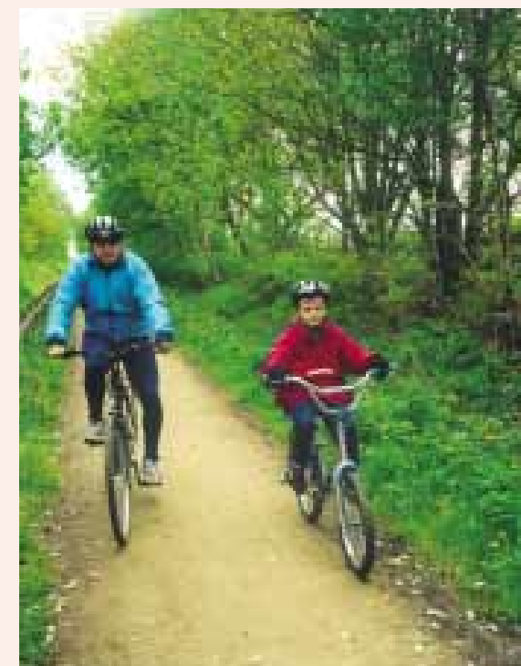
Cyclists on the Trans Pennine Trail.